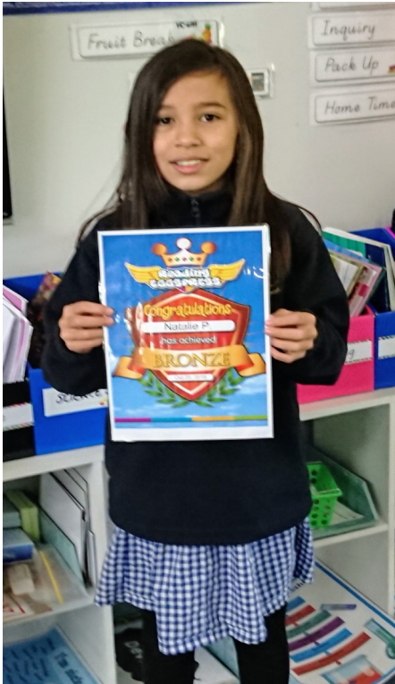
Reading Eggs - Reading Express Certificate